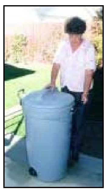
Use a trash can with a tight lid