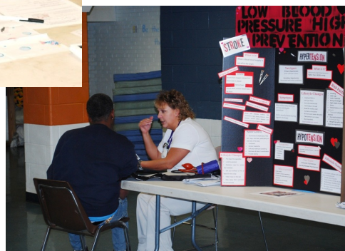
An Aurora University student nurse, above, gives a flu shot to a Hesed House resident while, at right, another checks a resident's blood pressure during a clinic at the shelter earlier this month.