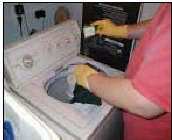
Wash clothes and bedding with detergent in hot water