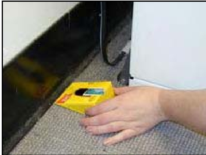
Place bait where you have seen mice or rats