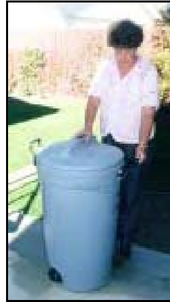
Use a trash can with a tight lid