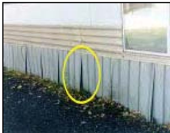
Fix gaps in trailer skirtings