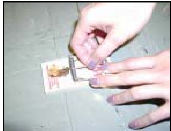
Use peanut butter on traps.