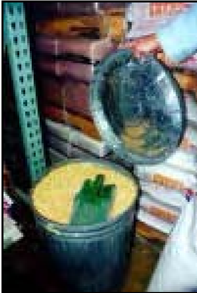
Keep animal feed in a container with a tight lid