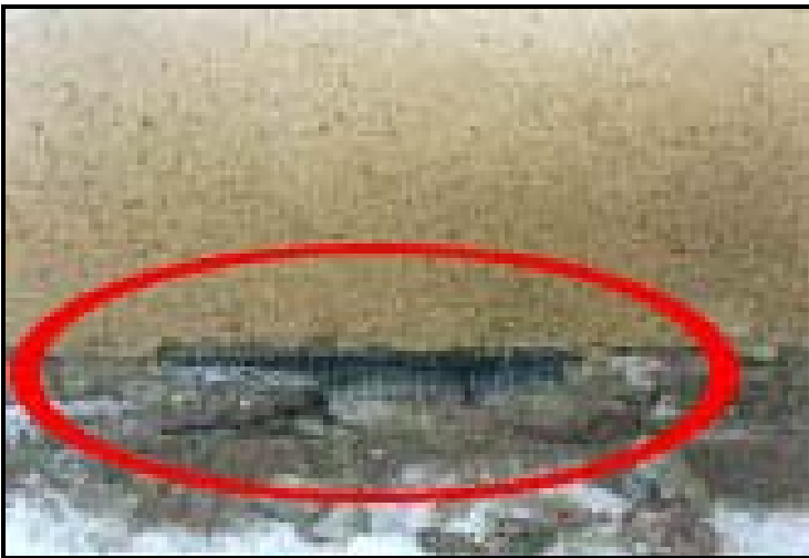
Fold lath metal and place in holes in the foundation of houses