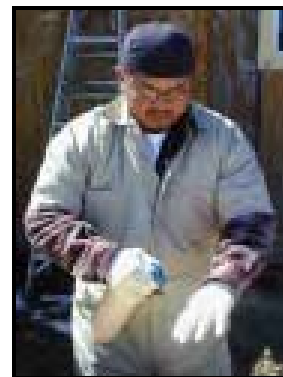
Spray gloves before taking them off