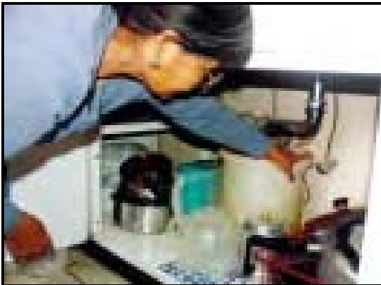
Look for holes.