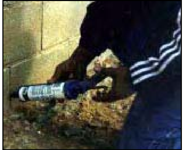
Seal holes with caulk