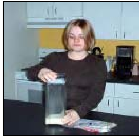
Store food in containers with lids.