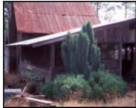
Air out cabins