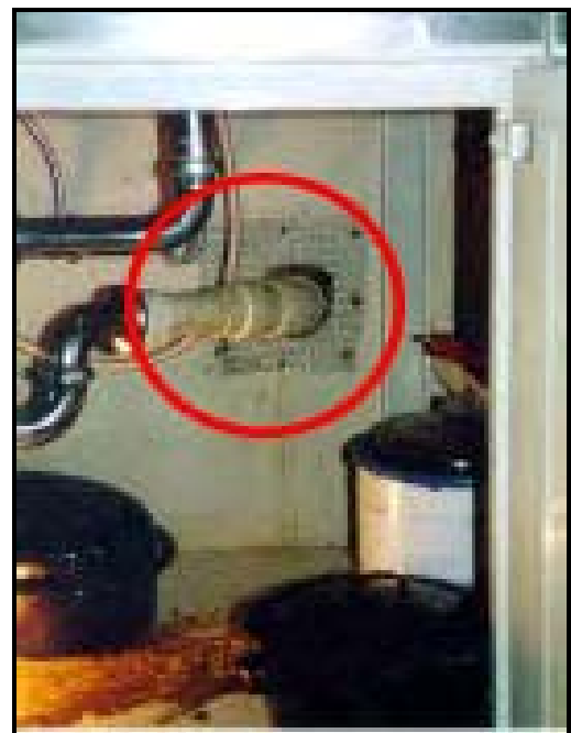
Use lath metal around pipes