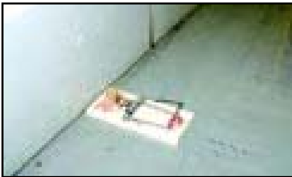
Place trap so it makes a "T" with the wall