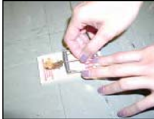
Use peanut butter on traps.