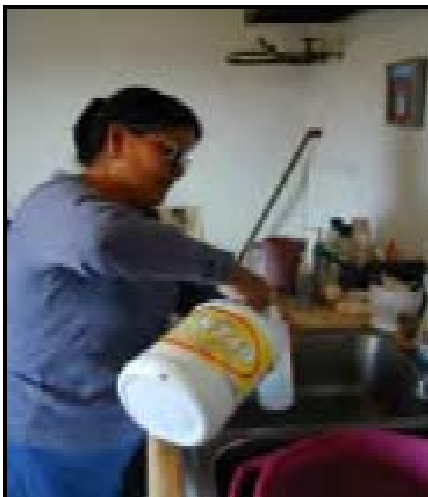
Bleach and water solution

Do not sweep or vacuum up mouse or rat urine, droppings, or nests. This will cause virus particles to go into the air, where they can be breathed in.