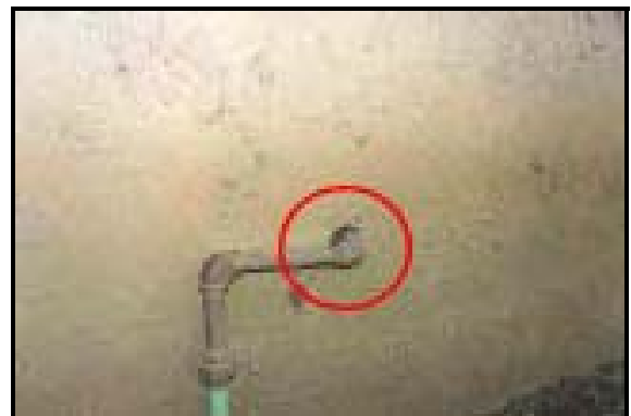
Look for gaps around pipes outside your home