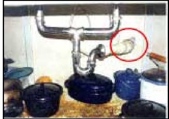
Look for gaps where the water pipes come into your home