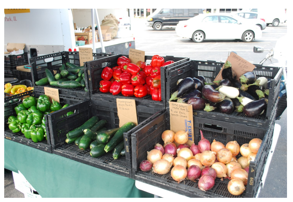
Aurora's Farmer's Market above, and at right

Our Community Health Improvement Plan (CHIP) calls for a healthy diet as one of the tools to help prevent chronic disease. And any healthy diet will include the types of farm-to-table produce to be found at our abundant markets located in all corners of the county. For a map of these markets visit our Kane Health Counts site by clicking <u>here</u>.