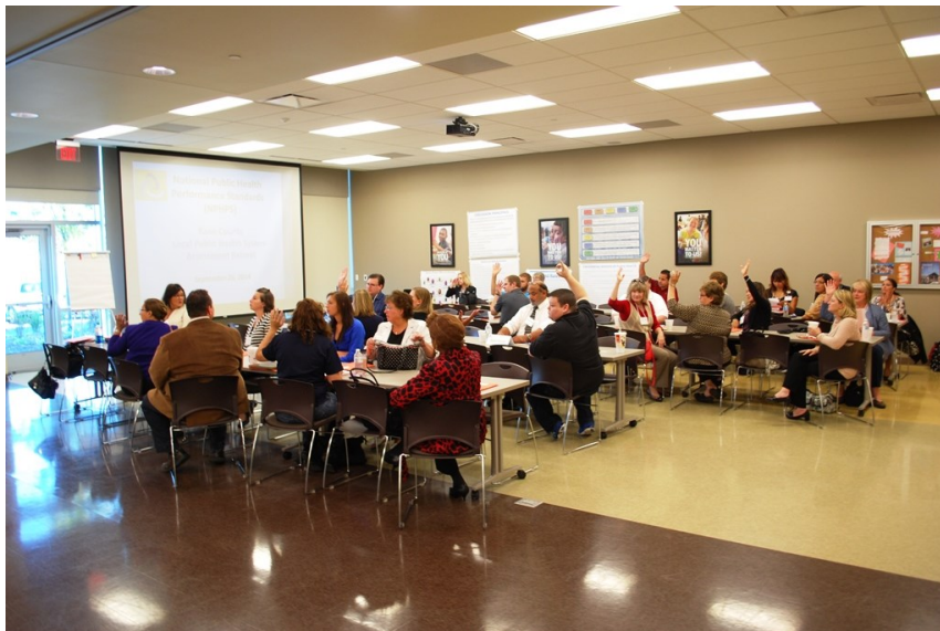
Participants in the Local Public Health System Assessment gathered in September. The report from their hard work is now posted on the KCHD website.

Engage the community to identify and solve health problems