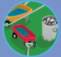
Any toy, garden equipment or container that can hold water