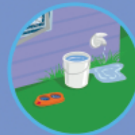
Leaky faucet or pet bowl (change water daily)