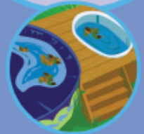
Pool cover that collects water, neglected swimming pool, hot tub or child's wading pool