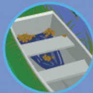
Uncovered boat or boat cover that collects water