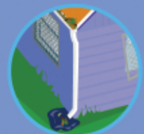
Clogged rain gutter (home and street)