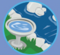
Birdbath (clean weekly) and ornamental pond (stock with fish)