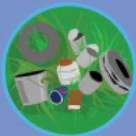
Trash and discarded tires (drill drain holes in bottom of tire swings)