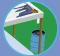
Flat roof without adequate drainage